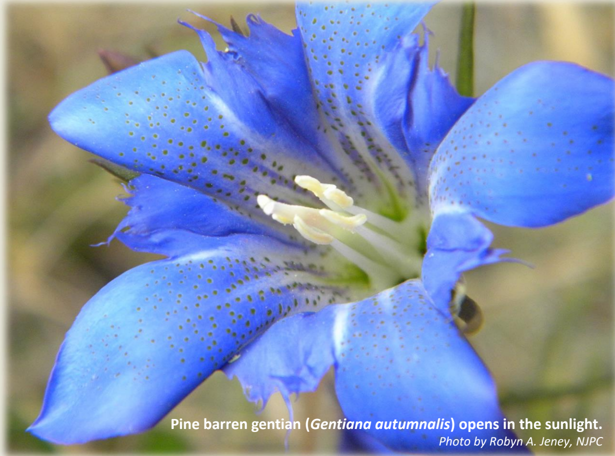
Pine barren gentian ( Gentiana autumnalis ) opens in the sunlight.