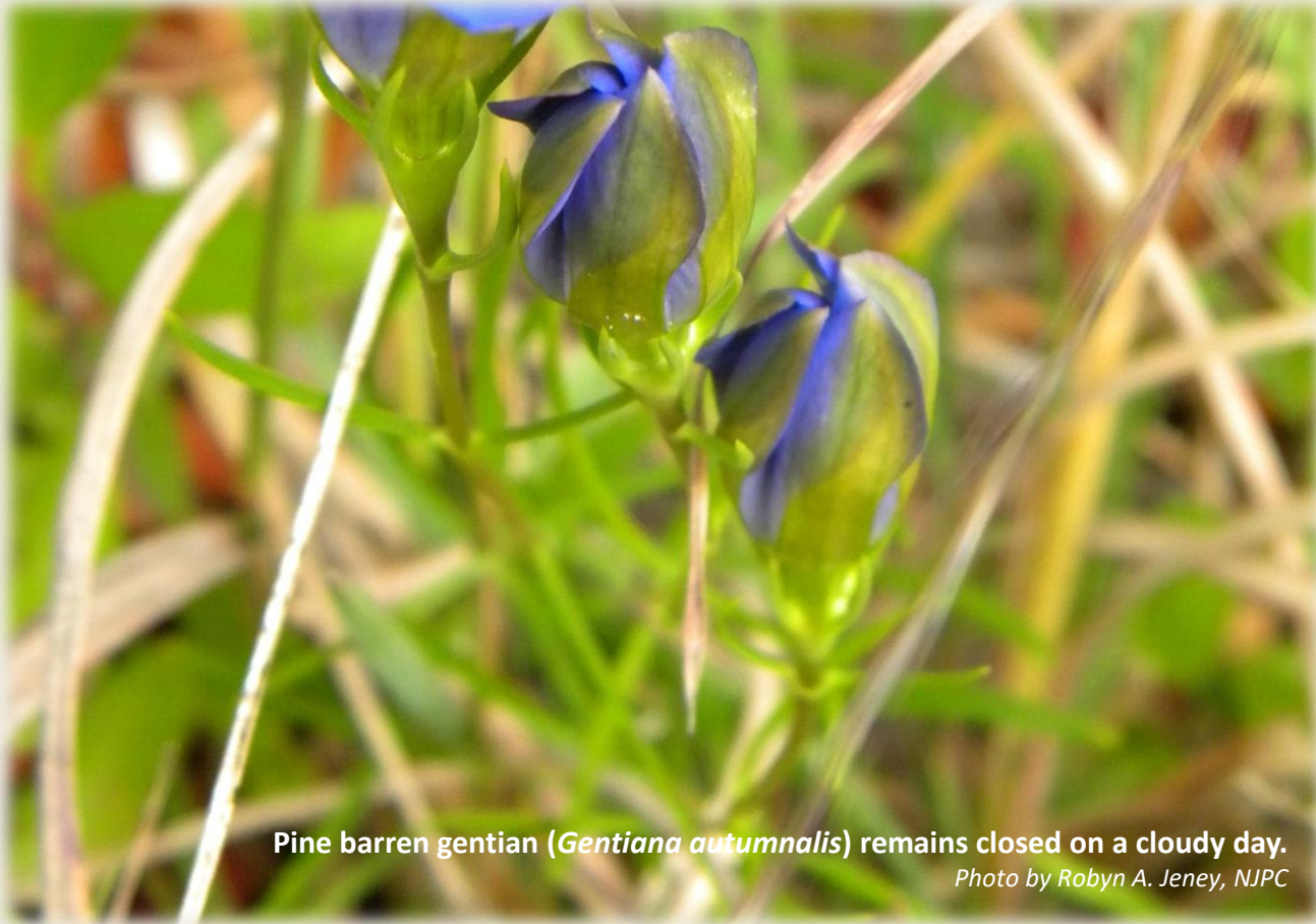
Pine barren gentian ( Gentiana autumnalis ) remains closed on a cloudy day.